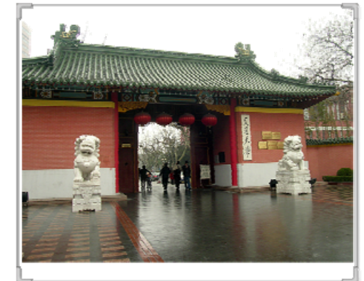
Shanghai Jiao Tong University