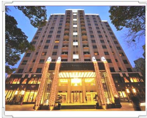
Shanghai Hengshan Hotel Map

APLAS 2010 will be held at Hengshan Hotel 534 Hengshan Road, Shanghai, 200030, China Tel: +86-21-64377050 Fax: +86-21-64333443